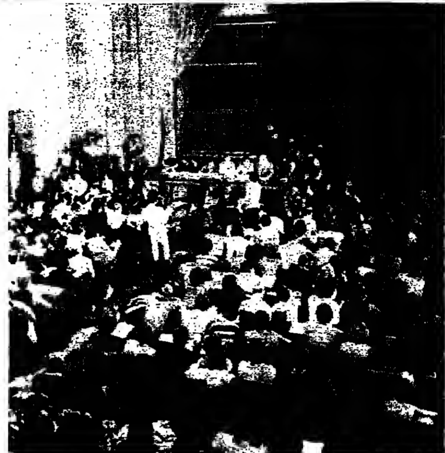
STUDENTS' MEETING: The striking students of Warsaw university meet Monday under the auspices of Poland's National Students' Union to consider Education Minister Gorski's offer of terms for settlement of their demands.

BANGKOK, Feb. 18 (AP) - Twenty persons were killed and more than 10 others injured when a provincial passenger bus collided head on with a ten-wheel truck in eastern Thailand Tuesday night, a highway police officer reported Wednesday. The accident occurred in Chachoengsao province when the bus driver tried to overtake another large truck, the officer said.